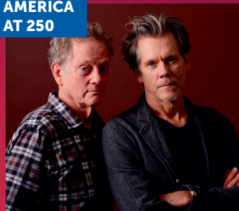
AMERICA AT 250 THE BACON BROTHERS Michael and Kevin Bacon June 20