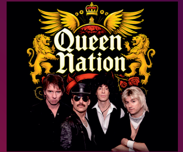
QUEEN NATION Tribute to the Music of Queen June 13