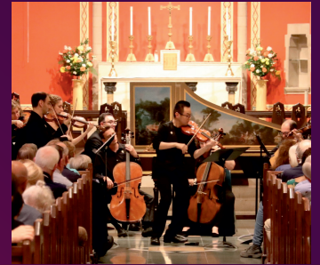
THE SEBASTIANS Bach Cantatas June 9