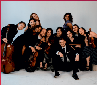
TWELFTH NIGHT ENSEMBLE Vivaldi's The Four Seasons June 11