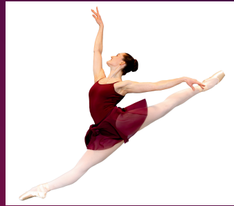
AN EVENING OF DANCE American Repertory Ballet + Princeton Symphony Orchestra June 7