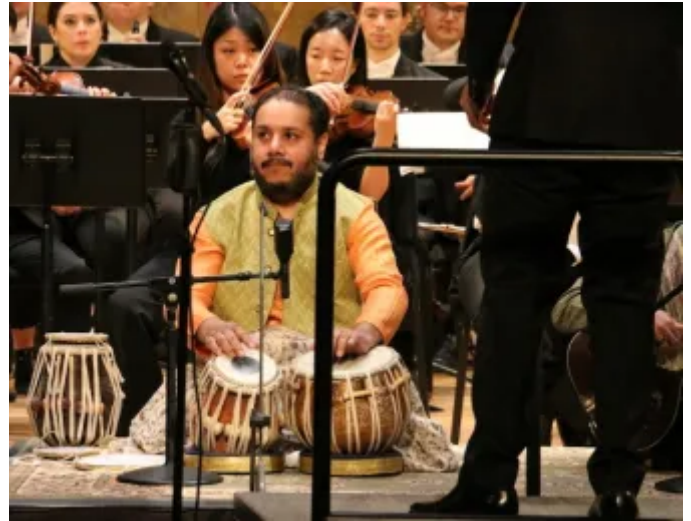
PRINCETON SYMPHONY ORCHESTRA