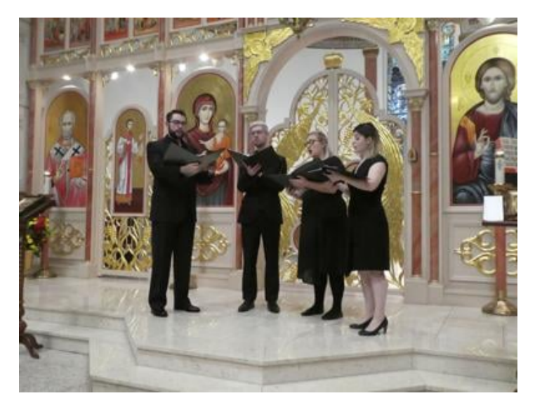
The Theoria a capella group performs at Assumption of the Virgin Mary Byzantine Catholic Church in Trenton on December 18.

Assumption of the Virgin Mary Byzantine Catholic Church, Grand and Malone streets, Trenton. www.avmbcc.org.