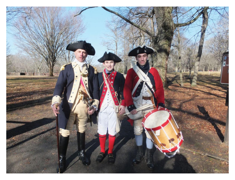
There are two chances to witness the reenactment of Washington crossing the Delaware: the December 12 dress rehearsal and the Christmas Day crossing.

The first crossing — or the annual dress rehearsal for the official reenactment — is set for Sunday, December 12, from 10 a.m. to 4 p.m. The ticketed event is designed to accommodate those who