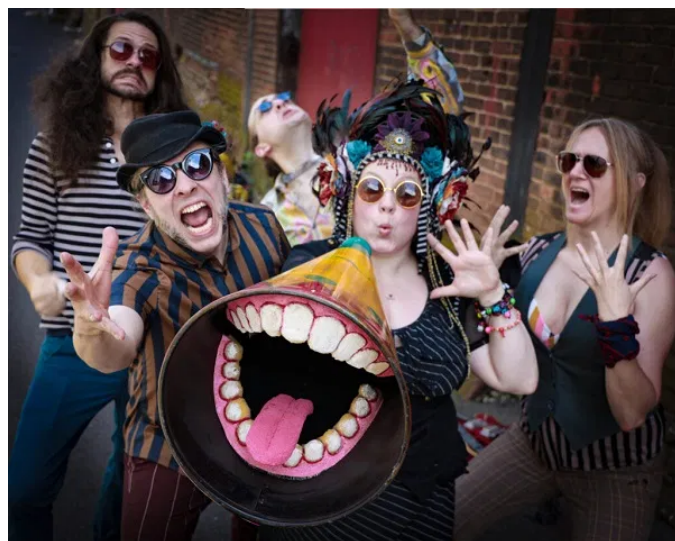
THIS WAY TO THE EGRESS