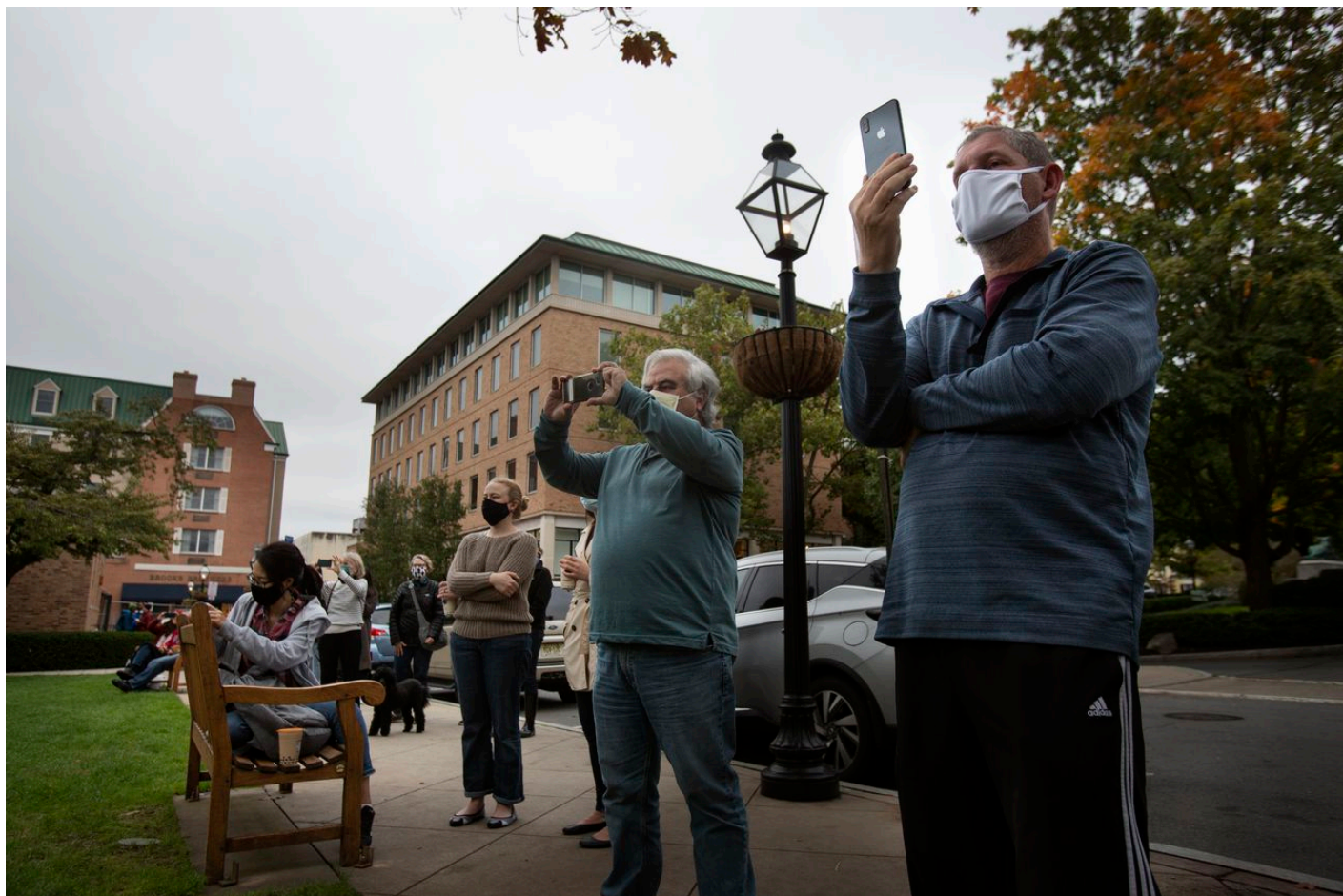
Spectators watch as The Princeton Symphony Orchestra has an outdoor professional film shoot at Palmer Square.