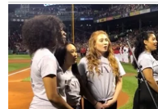
The Queens of SIX Perform at Fenway Park